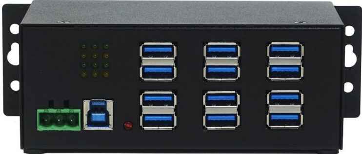
DIAGRAM OF HUB-1230i